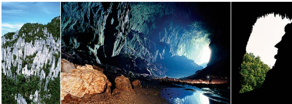
Gunung Mulu National Park