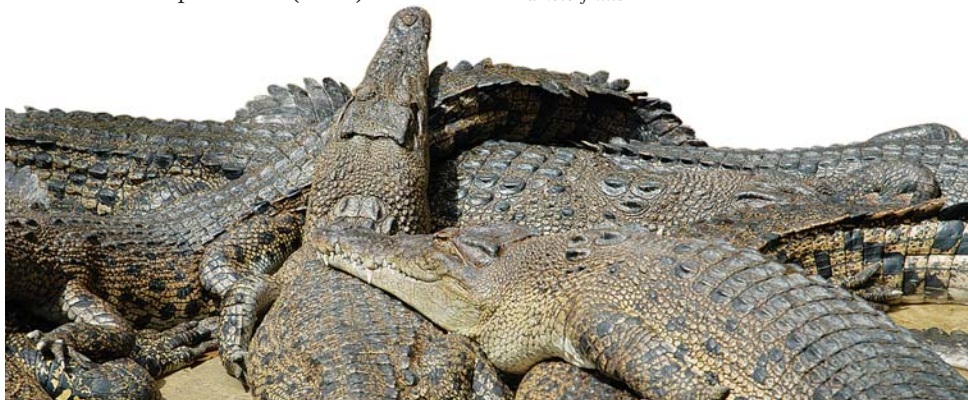
Miri Crocodile Farm