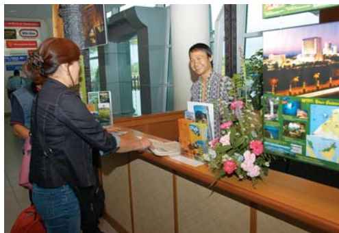
Miri Airport Visitors' Information Centre