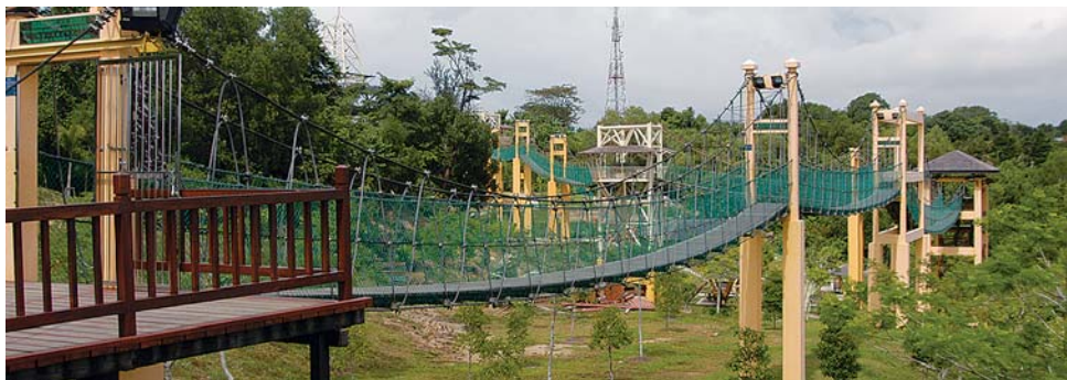
Taman Awam Miri