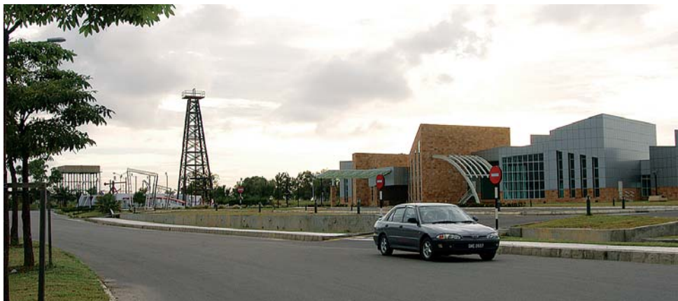
Grand Old Lady and Petroleum Museum, Canada Hill