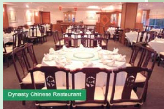
Dynasty Chinese Restaurant

Lot 683, Block 9, Jalan Pujut-Lutong Tel: 60-85-421111 Fax: 60-85-422222 E-mail: dyhlmyy@po.jaring.my