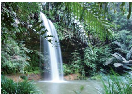
Lambir Hills National Park

Legend has it that seven fairy princesses once resided around the Latak waterfalls, and these spirits enticed men to bathe in the pools. The mythical ladies are safely married by now, so the area is considered safe for single men! 30 minutes' drive from Miri, the park is easily accessible by car. The public buses headed for Batu Niah and Bintulu pass the front gate of Lambir Hills.