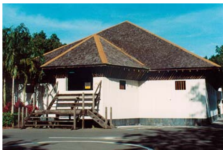
Fort Hose, Marudi

This township was the administrative centre of the Baram until it was superseded by Miri in the late 19th century. Fort Hose stands witness to the old days of tribal wars and the inception of Sarawak's first regatta. A number of hospitable longhouses in the Marudi area make this a popular tourist spot.