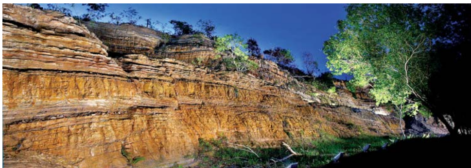
Airport Road Outcrop