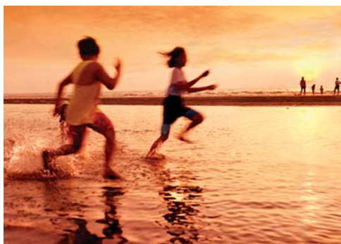
Fun time at the beach