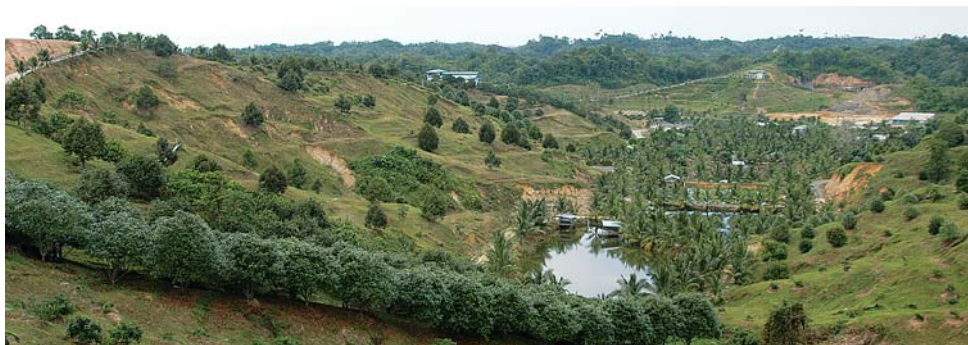
Soon Hup Farm