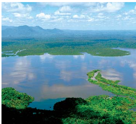
Loagan Bunut National Park

Now you see it now you don't! The 'shrinking lake' Loagan Bunut gives its name to this park. In the dry months of February until June, it is possible to walk right across dry mud flats of this popular bird-watching site. During the rainy season, they fill up to form a large, shallow lake. Wildlife changes with the seasons, wading birds giving way to insect eaters as the waters recede. The drive from Miri to Loagan Bunut National Park takes two to three hours by four-wheel drive vehicle.