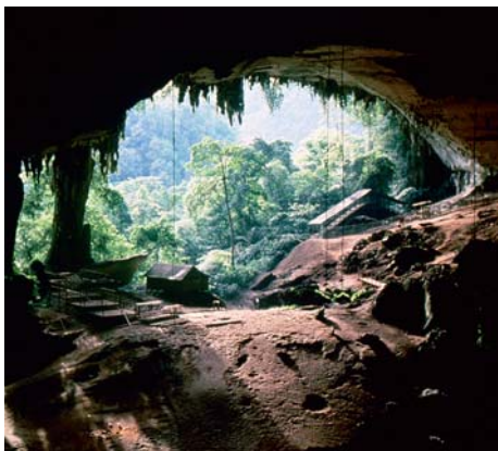
Niah National Park

The National Park HQ is easily reached by car. Public buses stop at Batu Niah, the nearest township; from there it is a pleasant boat ride, or a 45-minute stroll along the riverbank, to the National Park.